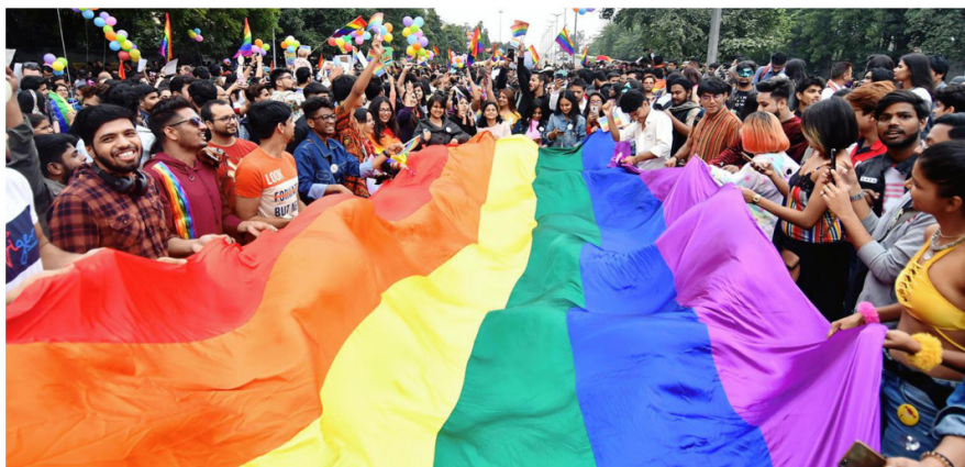
The next step: The Queer Pride March in 2019, New Delhi.