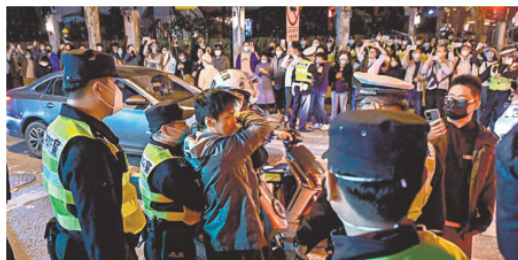
Police officers confront a man as people block Shanghai's Wulumuqi Street in protest against China's zero-COVID policy.

New COVID-19 cases crossed the 55,000 mark in China on November 23, while the number of deaths have remained low