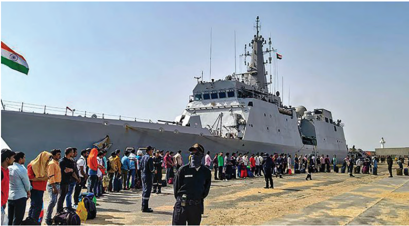
Rescue route: Indians queuing up to board Navy ship INS Sumedha at Port Sudan on Tuesday.

The group of 278 people was among the first to reach Port Sudan for evacuation; more measures are being taken to broaden Operation Kaveri