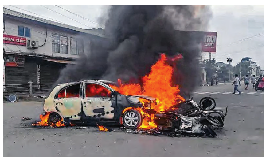
Vehicles set afire in the State capital Imphal on Thursday.

"The Army and Assam Rifles personnel are conducting flag marches and aerial reconnaissance in the affected areas. We have rescued 5,000 people in Churachandpur and 2,000 each in Imphal and Moreh and lodged them in safe places," a defence spokesperson said. An additional 14 columns of the Army and paramilitary force have been kept on standby for deployment on short notice, he