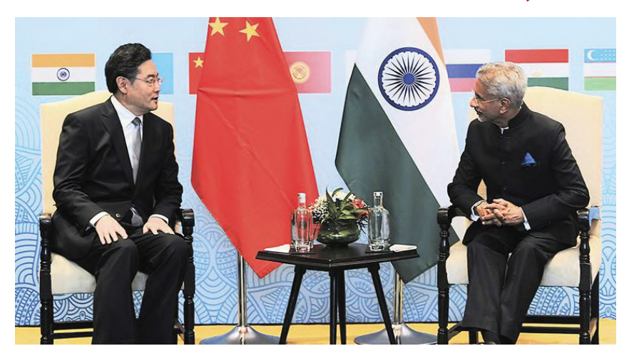
External Affairs Minister S. Jaishankar with his Chinese counterpart Qin Gang on the sidelines of the SCO meet in Goa on Thursday.

The unresolved three-year-old military stand-off at the Line of Actual Control (LAC) remained the "focus" of India-China talks as External Affairs Minister S. Jaishankar met with Chinese Foreign Minister Qin Gang here on Thursday, and held a "detailed" discussion on bilateral ties.