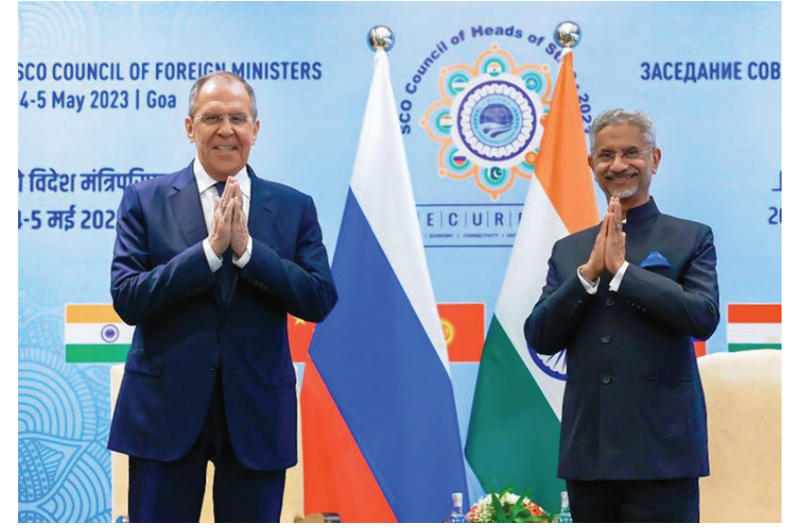
Boosting measures: External Affairs Minister S. Jaishankar with his Russian counterpart, Sergei Lavrov, in Goa on Thursday.

The sources said that the SCO Foreign Ministers will discuss the induction of Iran and Belarus as full members at their meeting, and will forward their applications