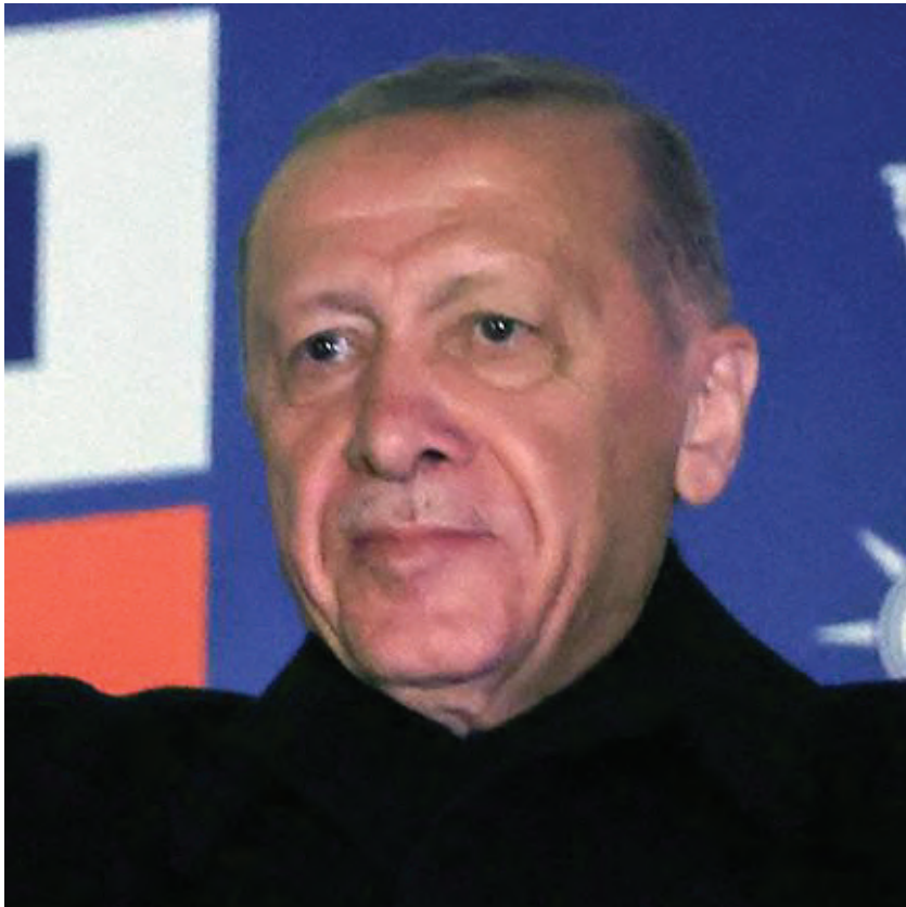
Recep Tayyip Erdogan

Turkish President Recep Tayyip Erdogan on Monday emerged from his toughest election test unbowed and in strong position to extend two decades of