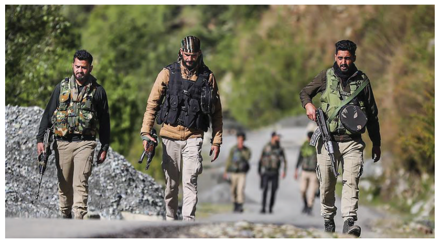
Obstacle course: Official sources say this region is in need of more police and Army personnel. File photo