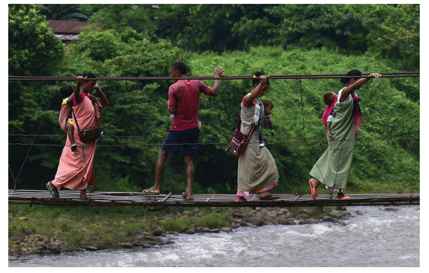
The Khasis, numbering about 1.39 lakh, are one of the three indigenous matrilineal communities in Meghalaya.

Asserting that the KHADC was committed to the preservation and