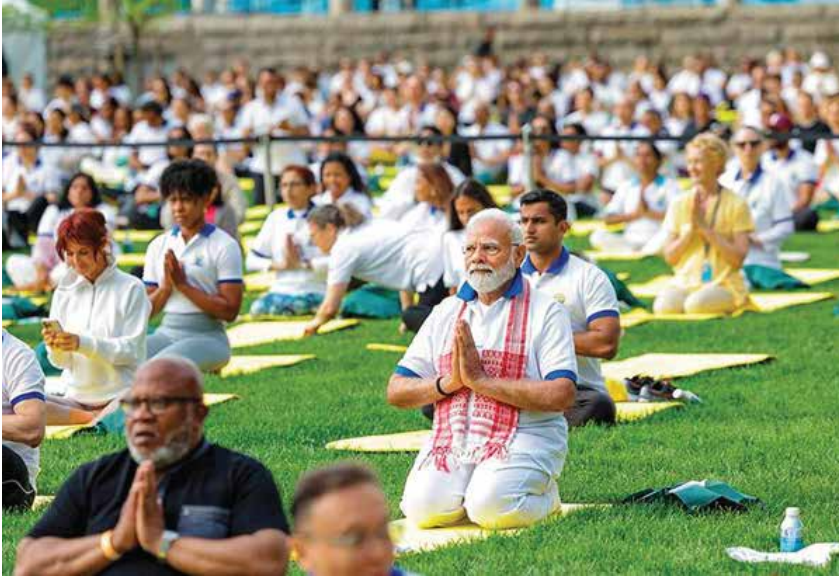
Global stage: Prime Minister Narendra Modi at a yoga session at the UN headquarters in New York on Wednesday.

Prime Minister Narendra Modi landed in Washington DC on a wet Wednesday afternoon to kick off the main part of his first state visit to the United States. Some 200 of his supporters had gathered outside the Willard Hotel in the capital to greet Mr. Modi upon his arrival from New York, where he spent the night.