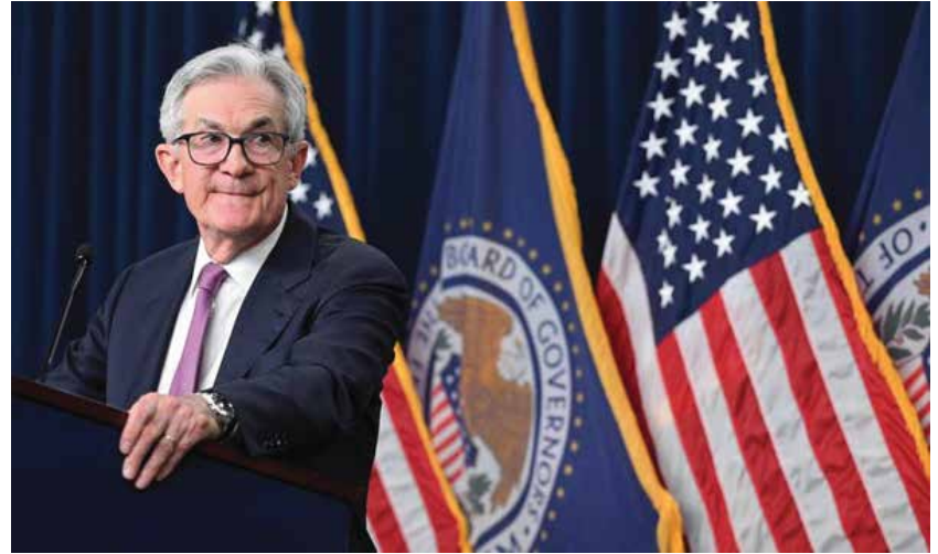
Taking a break: Federal Reserve Board Chairman Jerome Powell speaking at the Federal Reserve in Washington, D.C., on June 14.

U.S. Fed Chairman Jerome Powell said that the central bank is waiting for signs that there has been a decisive slowdown in inflation before it decides on further actions. It should be noted that the Fed began raising interest rates after inflation hit multi-decade highs as the U.S. economy slowed down due to COVID-19 lockdowns and the central bank responded by flooding the economy with dollars. While inflation has dropped from a peak of 9.1% in June last year to 4% in May this year, it is still higher than the Fed's stated target of keeping inflation within 2%. And even though U.S. unemployment has risen slightly to 3.7% in May this year, it has witnessed a steady fall since the highs seen during the pandemic. In other words, the labour market does not seem to be heavily affected by the Fed's rate hikes since last year. Moreover, the effects of monetary policy usually take time to impact prices in the wider economy. So, the Fed may be cautious after a series of ten rate hikes about allowing interest rates to rise too much and too soon. A rapid withdrawal of monetary support can cause prices to