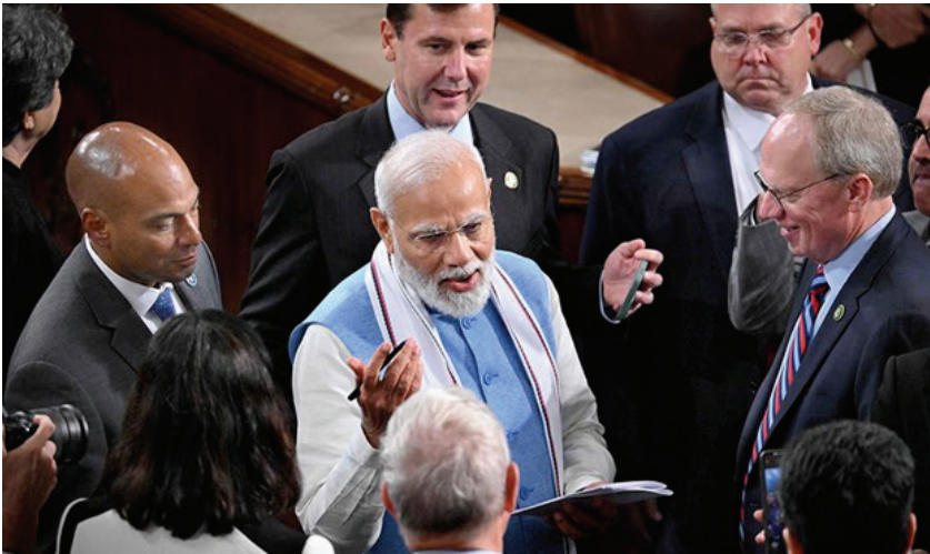
Trusted partners: Prime Minister Narendra Modi signs autographs for U.S. lawmakers at the U.S. Capitol in Washington DC.

Modi and Biden launched two Joint Task Forces on advanced telecommunications, focused on Open RAN and R&D in 5G/6G tech; An MoU on semiconductor supply chain has also been signed