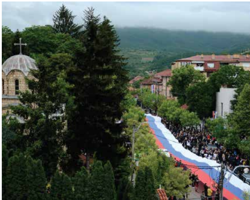
Tensions remain high: Hundreds of ethnic Serbs carry a giant Serbian flag through the town of Zvečan, in northern Kosovo, on May 31.

Where do the roots of tensions between Kosovo and Serbia lie? What happened after Kosovo declared independence in 2008? What triggered the recent clashes? Where do the EU-brokered resolution talks stand? What role does Russia, NATO and the EU play in the conflict?