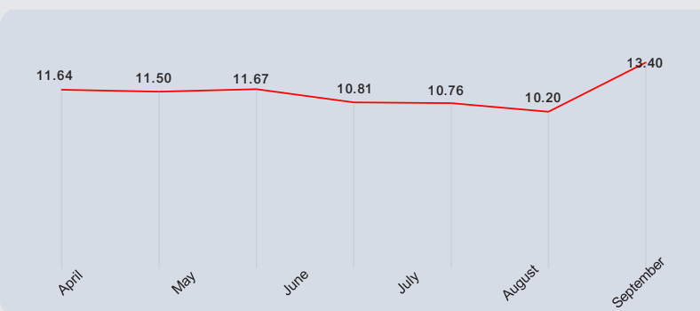
FIGURE: Line chart representation of growth rate of Goods & Services Tax (GST) receipts (Cr.) (on Y-o-Y basis).

Growth in India's gross Goods and Services Tax (GST) revenues bounced back in October with tax collections rising at a 10-month high pace of 13.4% to hit the second-highest monthly tally of ₹1.72 lakh crore. October's GST receipts were 5.7% over the kitty in September, when growth in the indirect tax had slowed to a 27-month low of 10.2%. The 13.4%