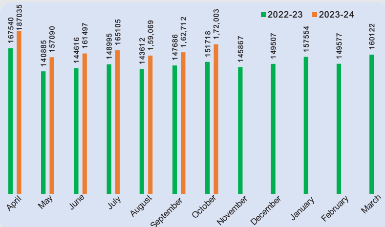
FIGURE: Column chart representation of Goods & Services Tax (GST) receipts (Cr.) (on Y-o-Y basis).

CONTEXT: The gross GST revenue collected in the month of October, 2023 is ₹ 1,72,003 crore out of which ₹ 30,062 crore is CGST, ₹ 38,171 crore is SGST, ₹ 91,315 crore (including ₹ 42,127 crore collected on import of goods) is IGST and ₹ 12,456 crore (including ₹ 1,294 crore collected on import of goods) is cess. The average gross monthly GST collection in the FY 2023-24 now stands at ₹1.66 lakh crore and is 11% more than that in the same period in the previous financial year.