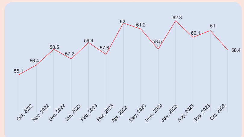
FIGURE: Column chart representation of the monthly S&P Global India Services Purchasing Managers' Index (PMI).

New orders rose to its second-fastest rate since June 2010 pushing the S&P Global India Services Purchasing Managers' Index (PMI) from 60.1 in August to 61 in September.