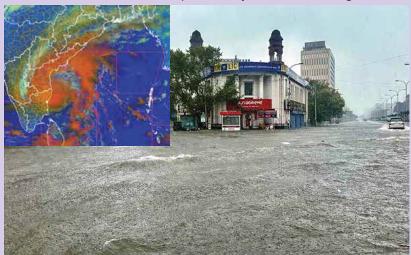
The G.P. Road junction on the arterial Anna Salai inundated in heavy downpour in Chennai on Monday.

CONTEXT: Six persons were killed in cyclone-related incidents in Chennai and its neighbouring districts marooned by relentless rain under the impact of Cyclone Michaung.