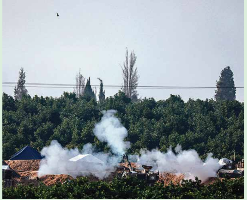
Precision strike: An Israeli tank firing towards the Palestinian territory amid continuing battles between Israel and Hamas.

CONTEXT: Israel's military renewed calls on Monday for mass evacuations from the southern town of Khan Younis, where tens of thousands of displaced Palestinians have sought refuge in recent weeks, as it widened its ground offensive and bombarded targets across the Gaza Strip.