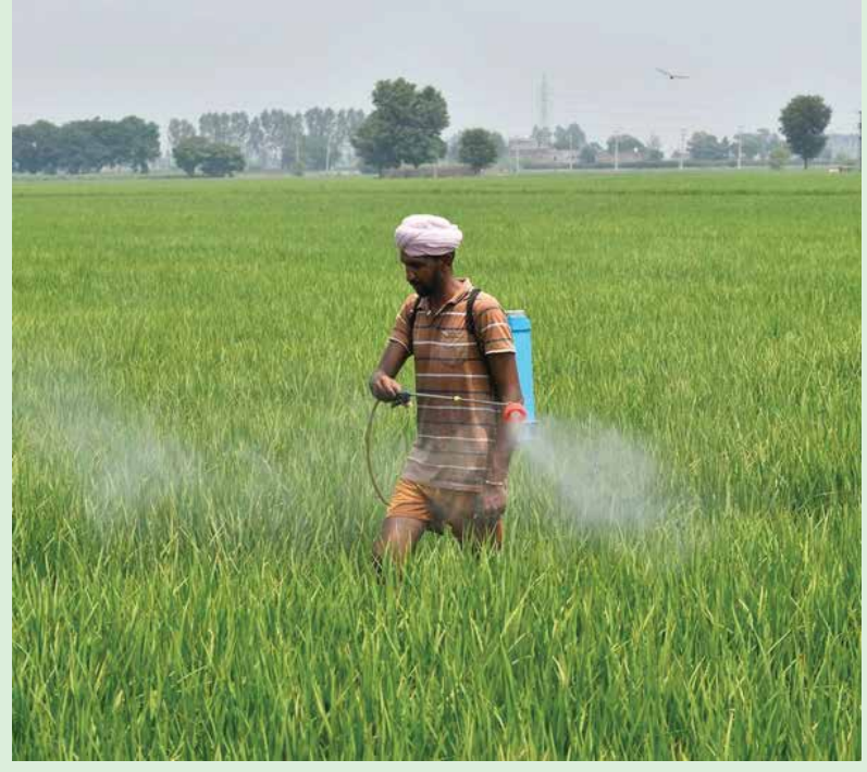
Different approach: A farmer spraying pesticides in a paddy field, in Kharak Singhwala, Mansa district in Punjab, on August 21.

CONTEXT: The United Nations Food and Agriculture Organization (FAO) report estimate the hidden costs of our global agri-food systems, surpassing an astonishing $10 trillion.