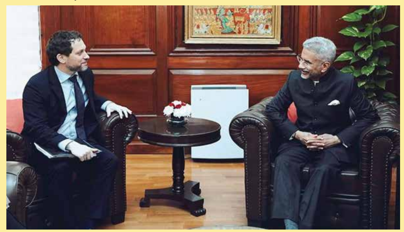
Brass tacks: External Affairs Minister S. Jaishankar meets Principal Deputy NSA of the U.S. Jonathan Finer in New Delhi on Monday.

CONTEXT: India and the U.S. have been able to surmount all challenges to bilateral ties despite many differences in their relationship.