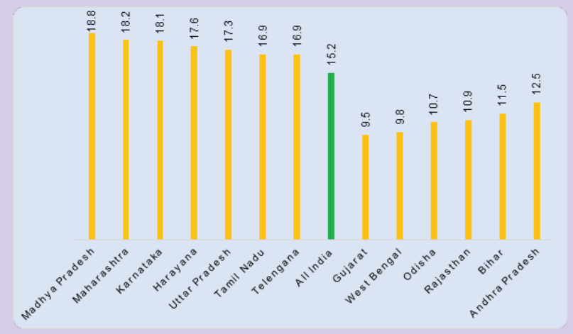
FIGURE: Column chart representation of GST growth rates of Major States. (Source: Bank of Baroda's analysis of the Finance Ministry data)

CONTEXT: The National Statistical Office estimated private final consumption expenditure (PFCE) to grow just 4.4 % this year, the slowest since 2002-03, barring the pandemic-affected year of 2020-21. After recovering to 6 % in the April to June 2023 quarter from below 3 % in the second half of 2022-23, the PFCE growth had slipped to 3.1 % in the July-September quarter.