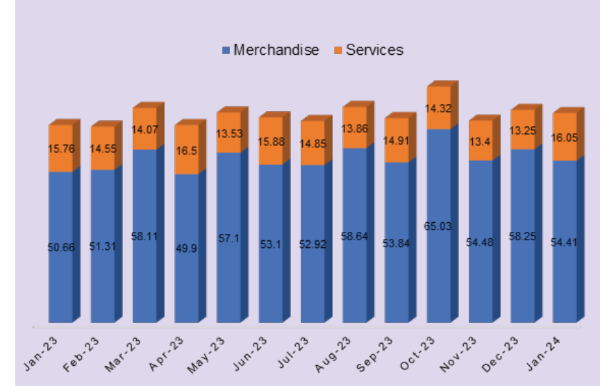
FIGURE: Column chart representation of monthly value of merchandise and services imports