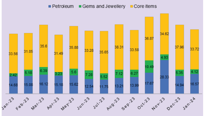
FIGURE: Bar chart representation of the import profile of Indian imports. Gems & Jewellery*: Gold, Silver & Pearls, precious & Semi-precious stones.

Exports from sectors like gems and jewellery had been impacted by the Ukraine war, while engineering exports, constituting almost 26 %, had maintained its composition this year. A $1 trillion merchandise export target by 2030 requires a 12 % growth rate, but challenges like the war persist. The PLI scheme must not only aid in import substitution, but should become a tool to grow exports as well.