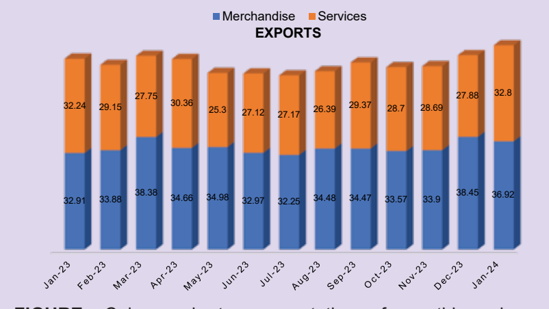
FIGURE: Column chart representation of monthly value of merchandise and services exports