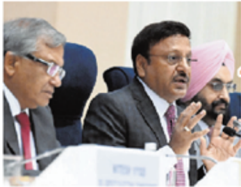
Battle lines drawn: Chief Election Commissioner Rajiv Kumar with fellow Election Commissioners addressing a press conference.

Making it count | A look at key dates of the two States heading to the polls